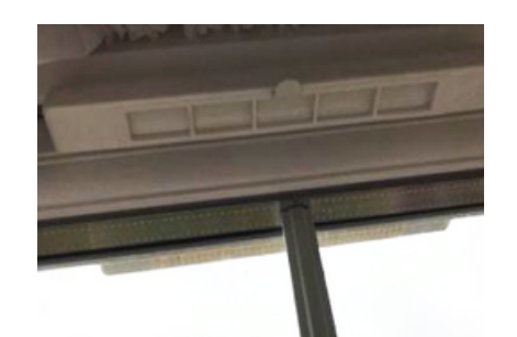
Window trickle vents